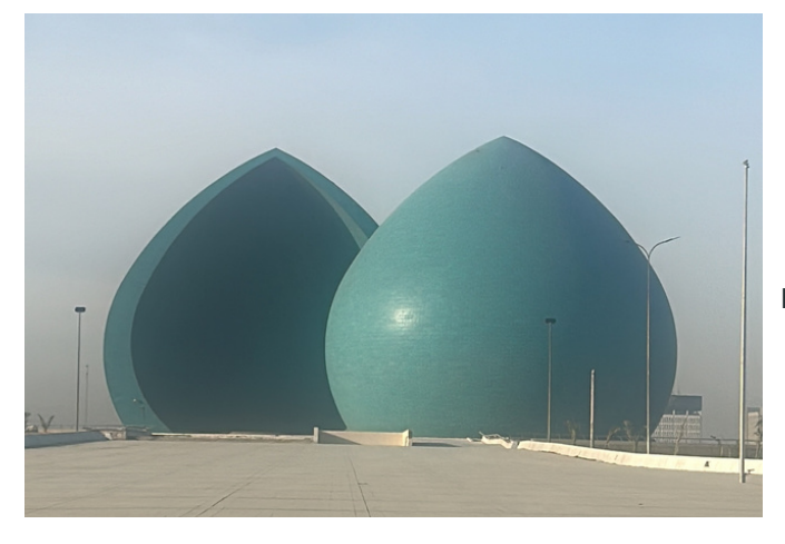
DAY 8 March 29, 2025